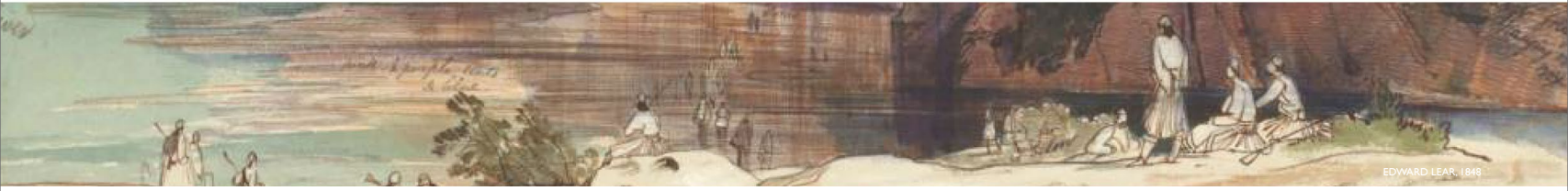
EDWARD LEAR, 1848