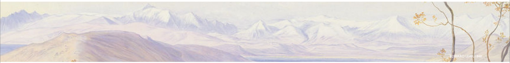
EDWARD LEAR, 1848