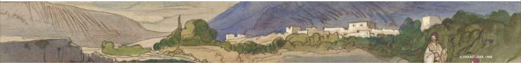
EDWARD LEAR, 1848