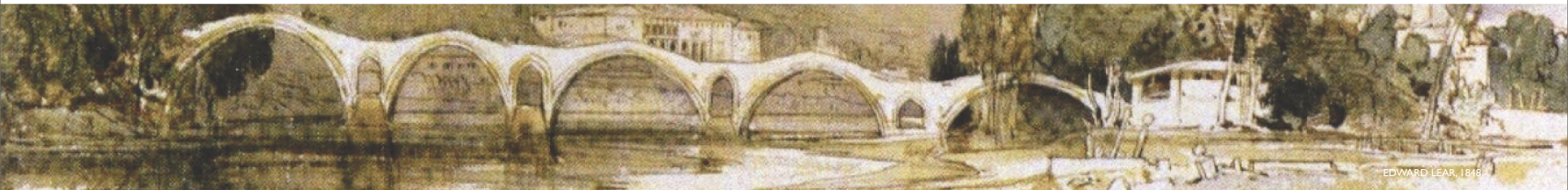
EDWARD LEAR, 1848